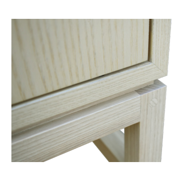
ANDERS BEDSIDE TABLE 24W × 19D × 29H HONNING.US