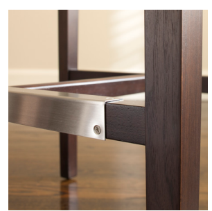
DISCRETE BAR CHAIR 20.5W X 18D X 41H HONNING.US