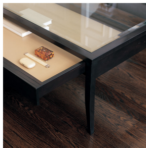
COLLECTOR'S TABLE 48W X 28D X 17H HONNING.US